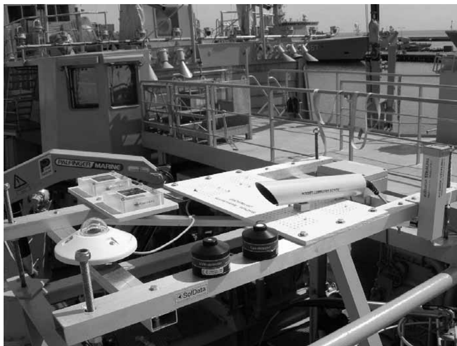
Fig. 2: The optics table was an aluminum frame firmly fastened to the aft port side of the vessel near the rail. The sky luminance sensor (at right) points towards the horizon with an elevation angle of about 10 degrees. The two SolData photovoltaic pyranometers are visible at the left rear behind the Kipp-Zonen CM 11.