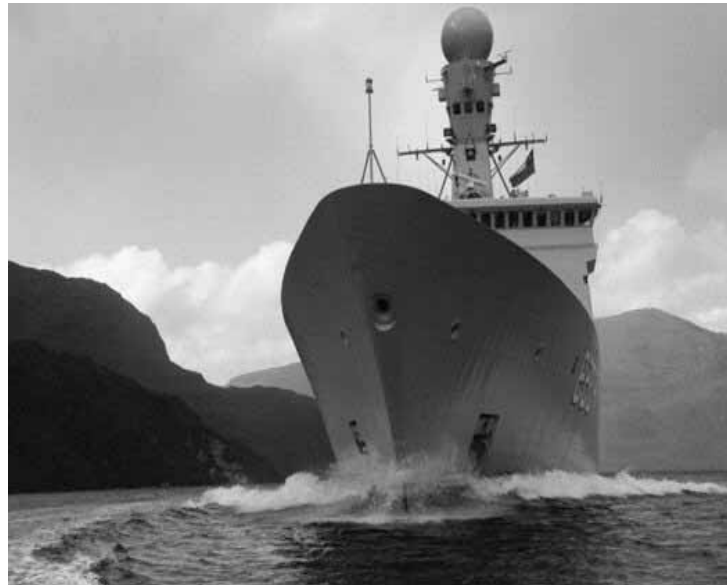
Fig. 1: The The Royal Danish Navy vessel Vædderen served as instrument platform for the SolData optics table during the 100.000 kilometer, eight month round the world voyage of exploration and scientific research. It was conducted under the auspices of the Danish Galathea 3 Expedition. Previous Galathea expeditions sailed from Denmark in 1845 and 1950.